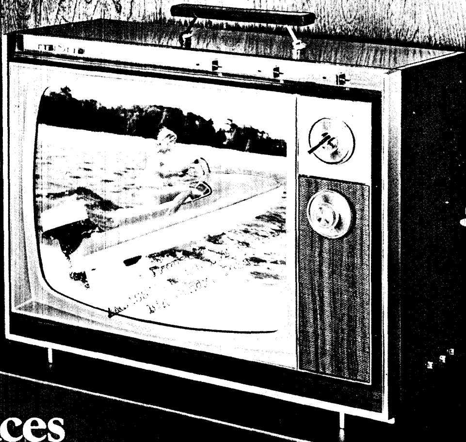
The Peale, Model C3722W Simulated TV Picture

Zenith introduces a portable that ...outcolors ...outbrightens ...outdetails, and ...outperforms every other color TV its size.