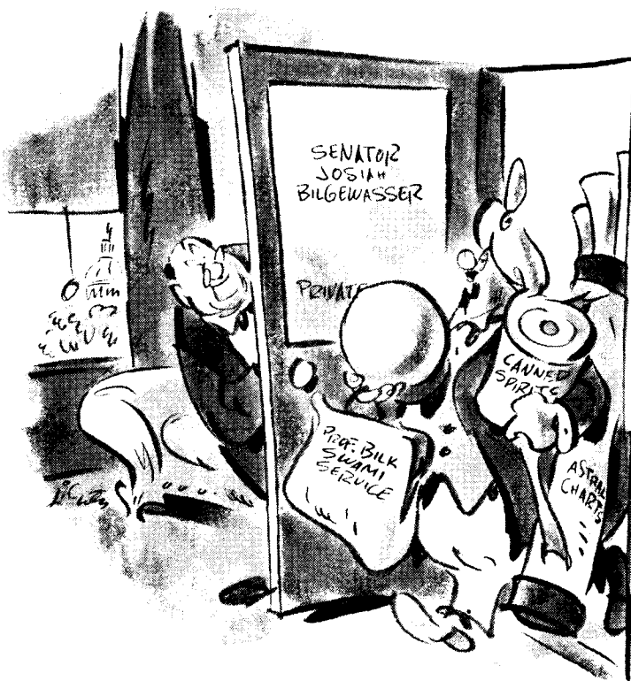
One gifted prophet casts a weekly horoscope for a prominent senator; he considers it an infallible guide to the conduct of government business