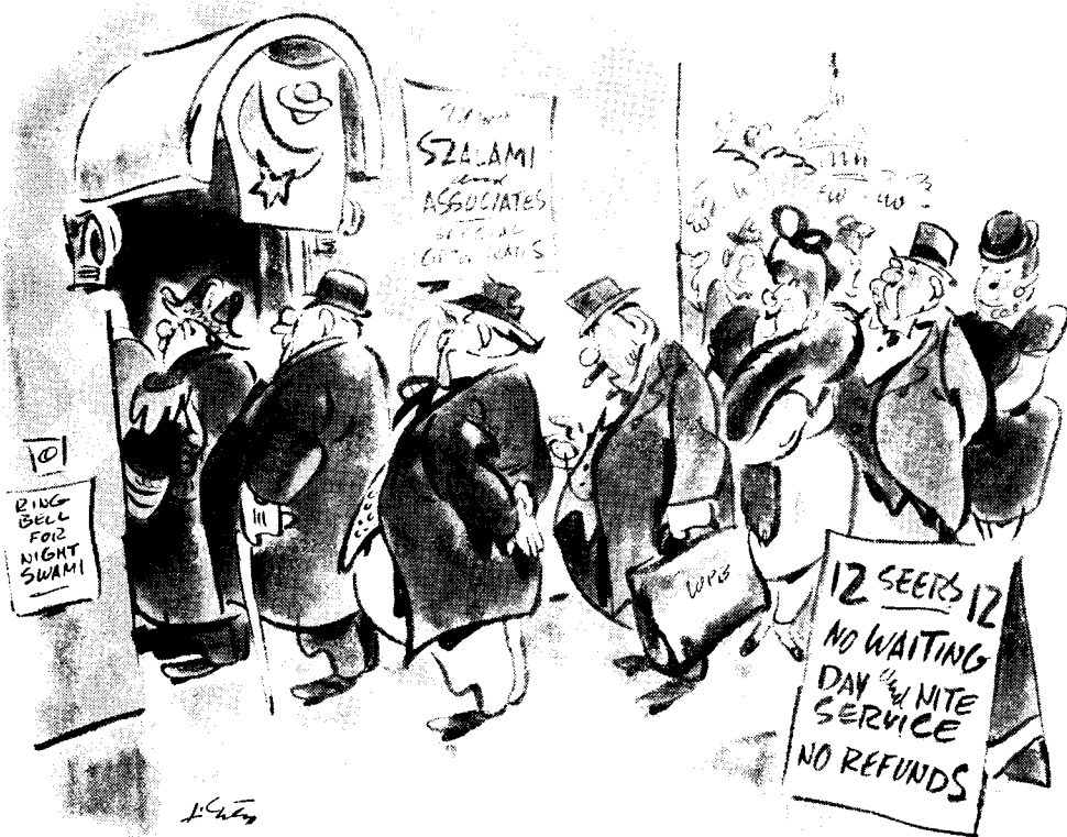
Most of the capital's seers do a land-office business; customers stand in line, eager to pay their money and find out what the future holds for them